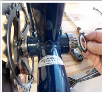
8. Make sure outer dust seal is in place before installing left crank arm.