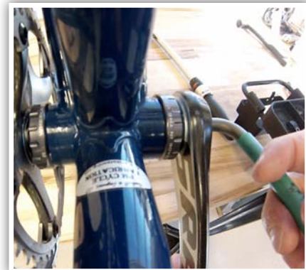
9. Install left crank arm, tighten crank to manufacturer specifications, approximately 48-54 Nm.