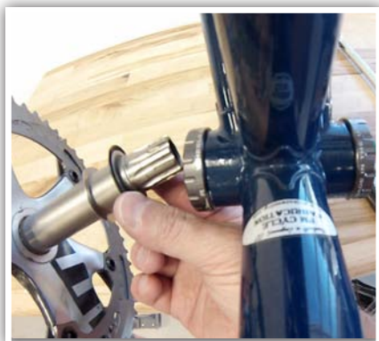
7. Install right crank arm, making sure wave washer and outer dust seal is installed.