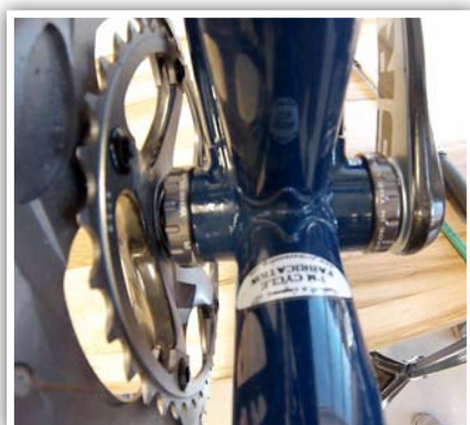
10. Add spacers as necessary to take up any play, remove spacers as necessary if binding occurs.

NOTE: Due to the wide variety of frame manufacturers, Wheels Manufacturing cannot guarantee compatibility with all frames. Please consult with your specific frame manufacturer before installation. Wheels Manufacturing is not responsible for damage done to your frame as a result of installation or use of this product.