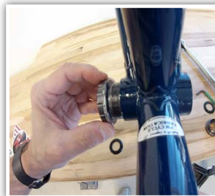
3. Insert drive side cup and center sleeve into frame.