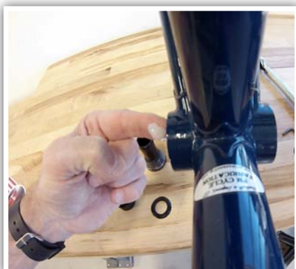
1. Thoroughly clean the bottom bracket shell. Apply a thin layer of grease to inner shell.

IMPORTANT: Thoroughly clean the bottom bracket shell and apply a layer of high quality grease to mating surfaces before installation. DO NOT use any brand bearing retaining compounds or epoxies during installation, use of which will void any warranty.