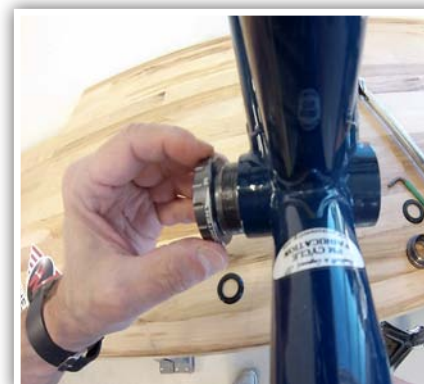
3. Insert drive side cup and center sleeve into frame.