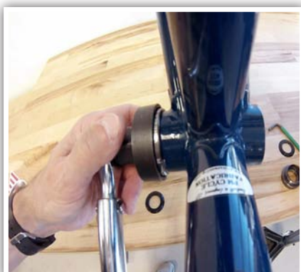
4. Use Park Tool BBT-69 to thread drive side cup into frame until flush. Using torque wrench, fully tighten to 35-50Nm.