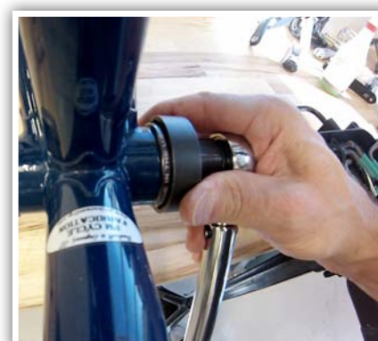
6. Use Park Tool BBT-69 to thread non-drive side cup into frame until flush. Using torque wrench, fully tighten to 35-50Nm.