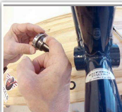
2. Apply a thin layer of grease to cup.