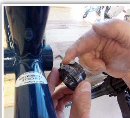
5. Apply a thin layer of grease to cup.