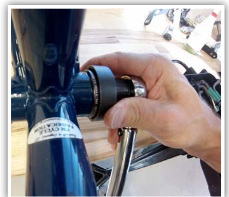
6. Use Park Tool BBT-69 to thread non-drive side cup into frame until flush. Using torque wrench, fully tighten to 35-50Nm.