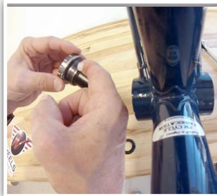
2. Apply a thin layer of grease to cup.