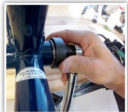
6. Use Park Tool BBT-69 to thread non-drive side cup into frame until flush. Using torque wrench, fully tighten to 35-50Nm.