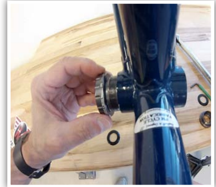
3. Insert drive side cup and center sleeve into frame.