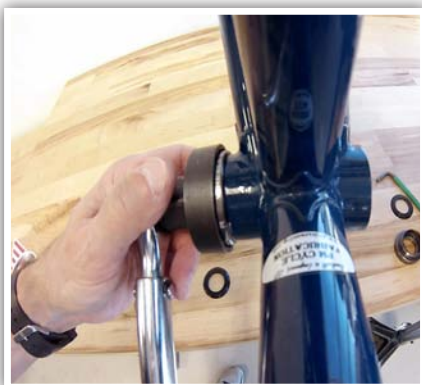
4. Use Park Tool BBT-69 to thread drive side cup into frame until flush. Using torque wrench, fully tighten to 35-50Nm.