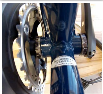
10. Add spacers as necessary to take up any play, remove spacers as necessary if binding occurs.

NOTE: Due to the wide variety of frame manufacturers, Wheels Manufacturing cannot guarantee compatibility with all frames. Please consult with your specific frame manufacturer before installation. Wheels Manufacturing is not responsible for damage done to your frame as a result of installation or use of this product.