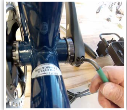
9. Install left crank arm, tighten crank to manufacturer specifications.