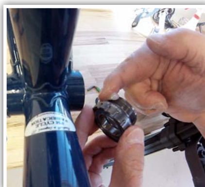
5. Apply a thin layer of grease to cup.