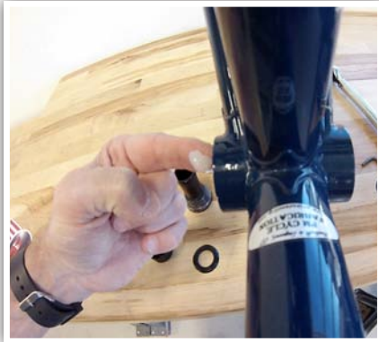
1. Thoroughly clean the bottom bracket shell. Apply a thin layer of grease to inner shell.

IMPORTANT: Thoroughly clean the bottom bracket shell and apply a layer of high quality grease to mating surfaces before installation. DO NOT use any brand bearing retaining compounds or epoxies during installation, use of which will void any warranty.