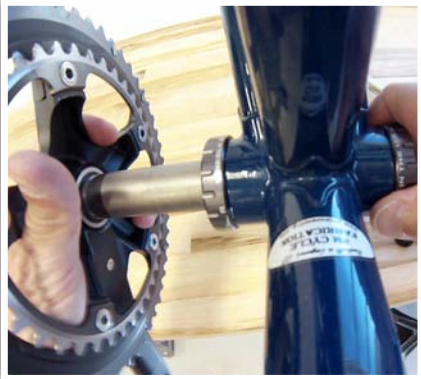
7. Install right crank arm, making sure outer dust seal is installed.