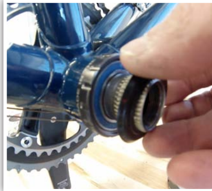
8. Make sure outer dust seal is in place before installing left crank arm.