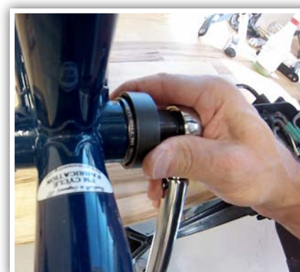
6. Use Park Tool BBT-69 to thread non-drive side cup into frame until flush. Using torque wrench, fully tighten to 35-50Nm.