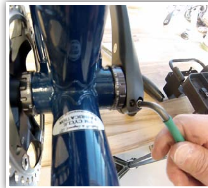
9. Install left crank arm, tighten crank to manufacturer specifications.