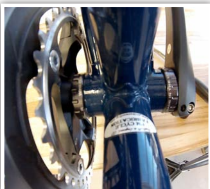
10. Add spacers as necessary to take up any play, remove spacers as necessary if binding occurs.

NOTE: Due to the wide variety of frame manufacturers, Wheels Manufacturing cannot guarantee compatibility with all frames. Please consult with your specific frame manufacturer before installation. Wheels Manufacturing is not responsible for damage done to your frame as a result of installation or use of this product.