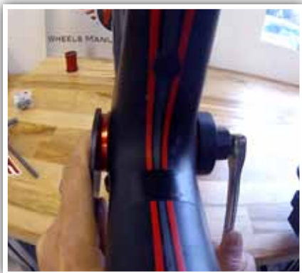
7. Using torque wrench, tighten cups to 35-50 Nm.