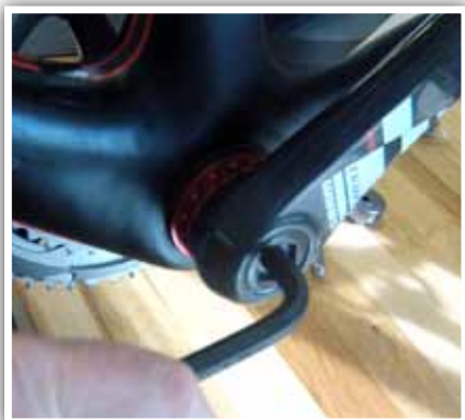
10. Install left crank arm, tighten crank to manufacturer specifications.