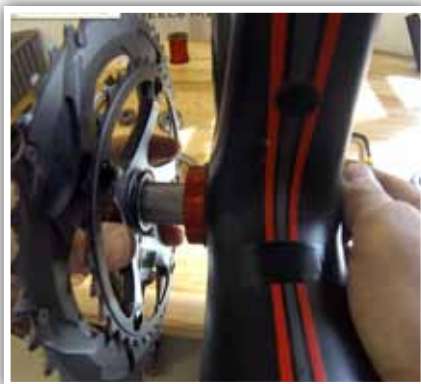
8. Install right crank arm, making sure wave washer and outer dust seal is installed.