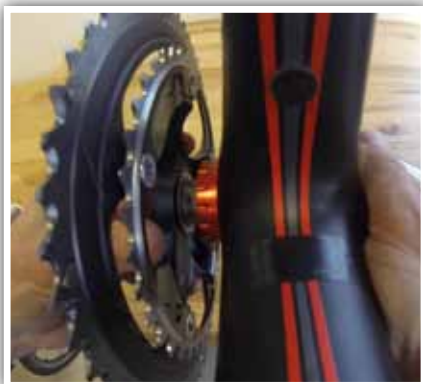
8. Install right crank arm, making sure outer dust seal is installed.