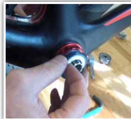
9. Make sure outer dust seal is in place before installing left crank arm.