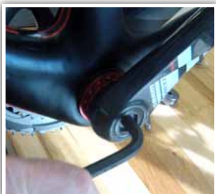
10. Install left crank arm, tighten crank to manufacturer specifications.