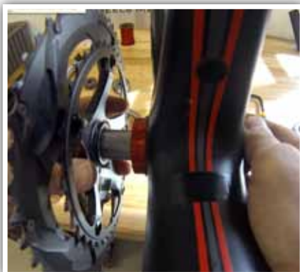
8. Install right crank arm, making sure wave washer and outer dust seal is installed.