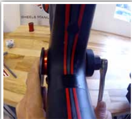
7. Using torque wrench, tighten cups to 35-50 Nm.