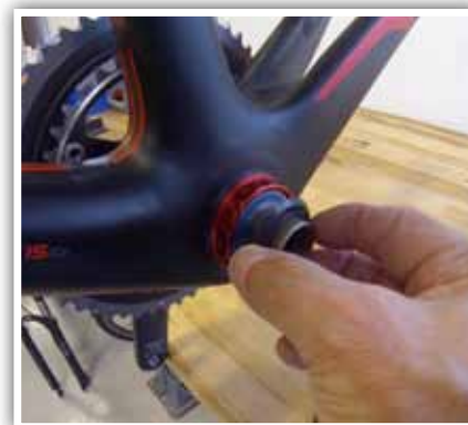
9. Make sure outer dust seal is in place before installing left crank arm.