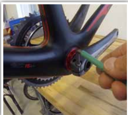
10. Install left crank arm, tighten crank to manufacturer specifications. Add spacers as necessary to take up any play, remove spacers as necessary if binding occurs.

NOTE: Due to the wide variety of frame manufacturers, Wheels Manufacturing cannot guarantee compatibility with all frames. Please consult with your specific frame manufacturer before installation. Wheels Manufacturing is not responsible for damage done to your frame as a result of installation or use of this product.